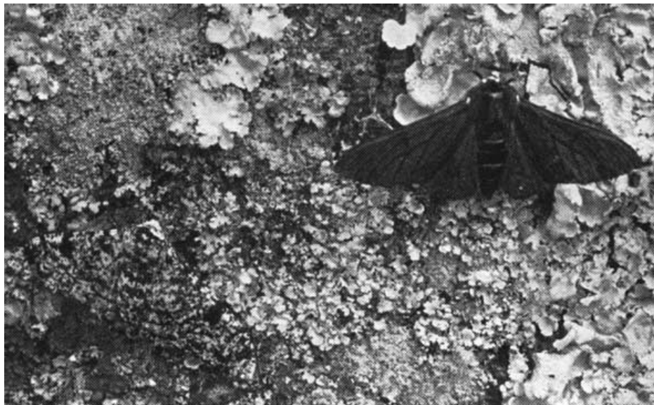
Fig. 1. Industrial melanism in the peppered moth.

Among a number of examples of natural selection in nature, industrial melanism in the peppered moth has been perhaps the most iconic. The peppered moth story was, at least until recently, a key demonstration of natural selection used in almost every textbook of evolution. Briefly, in the industrial revolution, "melanic" or black forms of the peppered moth ( Biston betularia – family Geometridae) became much more common than the typical pale form in polluted areas of Britain and elsewhere. From the 1890s onwards, biologists argued that the moths, which rest with their wings open on tree bark, are adapted in wing colour to the prevailing background. This is a form of camouflage, because bird predators would be able to find the moths if they didn't match their background visually (Figs. 1, 2). When the trees are dark and sooty, the moths are better off being black; when the trees are soot-free or lichen-covered, they are better off pale and mottled.